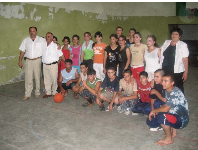
Youth at the gym in Arzni village school, Armenia; among them students sponsored by the Education Committee