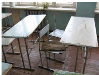
School conditions in Arzni

“In Dvin, we visited the village school (Pushkin) which has 360 students. State sponsors the teaching of Assyrian language in the school curriculum. We attended a second grade Assyrian language class. Students were phenomenal and very energetic. They did two plays for us in Assyrian (one on Assyrian alphabet and one with nationalistic theme).”