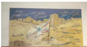
Paintings on school assembly hall walls in Arzni

“We visited Arzni on Thursday, June 1, 2006. ...We visited the village school which has a total of 370 students of which 160 are Assyrian. The Assyrian language is not taught in this school. But their assembly hall had two paintings hanging on the wall; both were Assyrian symbols. A piano with a few broken keys is sitting on the stage. But it is tuned very precisely.”