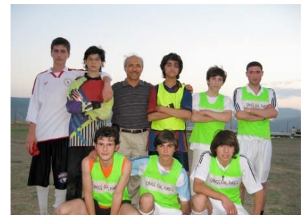
Assyrian Youth soccer team in Tbilisi, Georgia

“Thursday, June 8, 2006 was a really busy day for us in Georgia. We visited Kanda (30km west of Tbilisi), Gardabani (40km east of Tbilisi). We also met with the board of directors of the Assyrian National Congress of Georgia. Our car between two villages stopped working when switched from propane to gasoline. We pushed it as hard as we could; it did not work. It finally got towed and the engine started again”.