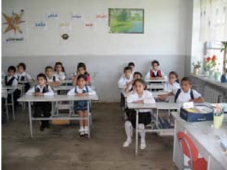
Second grade Assyrian language class in Dvin